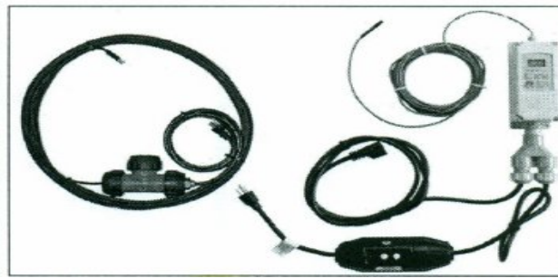
New Controller (01/11)